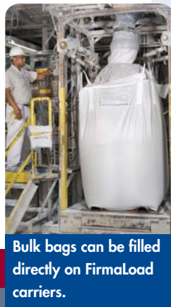
Bulk bags can be filled directly on FirmaLoad carriers.

The innovative, patent-pending designs of FirmaLoad carriers enable bags to stack tall and straight, making them safer, more stable and highly space efficient. They are easier to load, lighter to move and strong enough to do the job. Furthermore, they eliminate the possibility of bag punctures, tears and splinters that cause product waste, messy shipments and a poor reflection on your product at your customer's receiving dock.