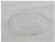
Item 3374 Fits 3357 Series 2000/case, 20000/skid