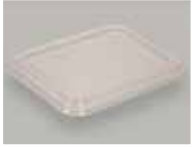
Item 7590FL Fits 7590 Series 300/case, 2400/skid