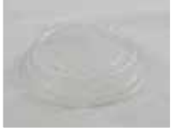
Item 3362 Fits 3357 Series 2000/case, 20000/skid